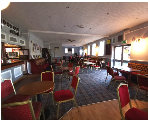
Speeders have the pub to themselves after an early finish.