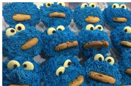
Darrel Goh's cookie monster cupcakes probably helped the judges decide that the Blue picnic (the hardest colour for food) was the best.

The issue of Bases Loaded dated 6/7/8 June 2017 reported on the tournament held the previous weekend. The Blue Lagoons won an unprecedented double by winning both the tournament proper, and the picnic competition. BL suggested "As far