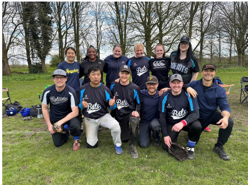
Comp winners Thunder (top) and Rec winners Bats (bottom)

fect softball conditions and not a spot of rain all day—rare in Manchester this time of the year! Thank you to all the teams who made the trip, and we’re looking forward to a great season!”