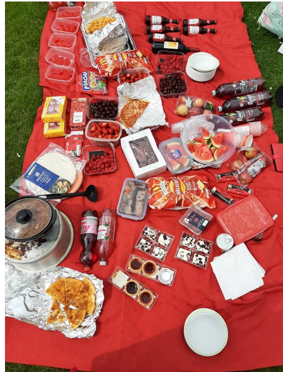
The red team’s winning picnic in 2021