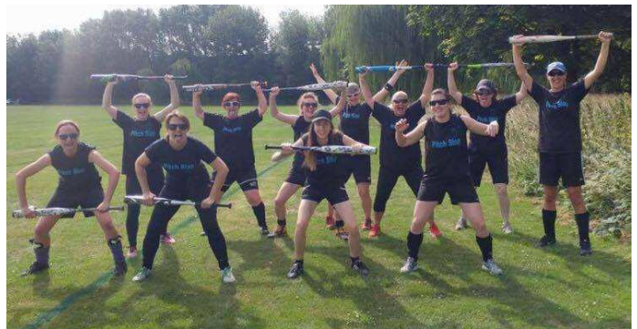
Pitchslap (above), Minx (below).

Unfortunately, there are no photos of the Hoggs team. None at all. On the other hand there are plenty of photos of the two Manchester teams in the women's competition, but there are no reports of how they got on.—Ed.